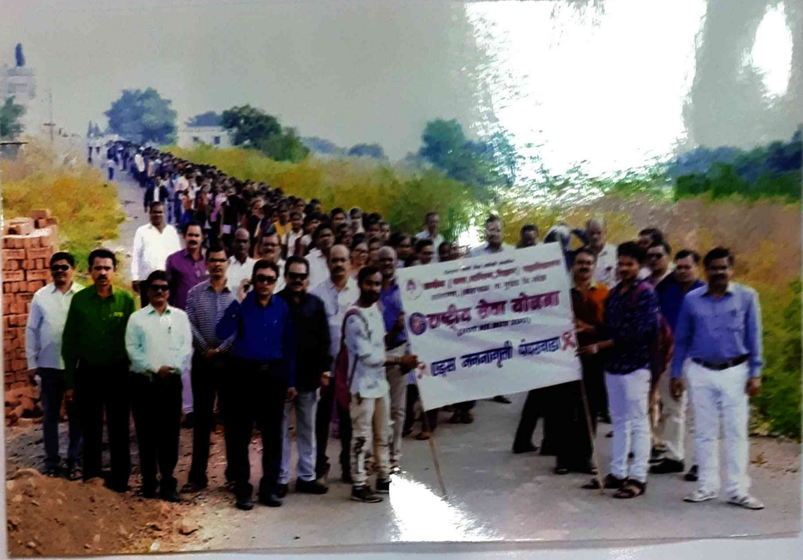
AIDS AWARENESS RALLY AT VASANTNAGAR & SHELKEWADI ON 17-12-2019