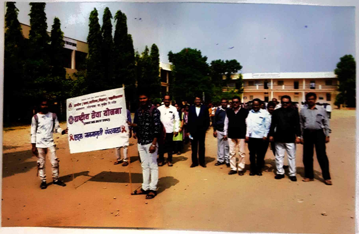
AIDS AWARENESS RALLY . ON . 17 - 12 - 2019