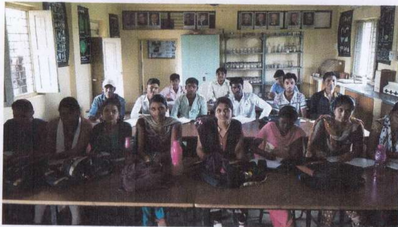
* Students hearing the guest lecture patiently in the classroom on dated - 19/09/2017.